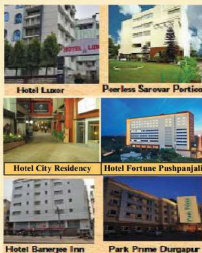
Major Hotels in Durgapur City Centre within 5 km.